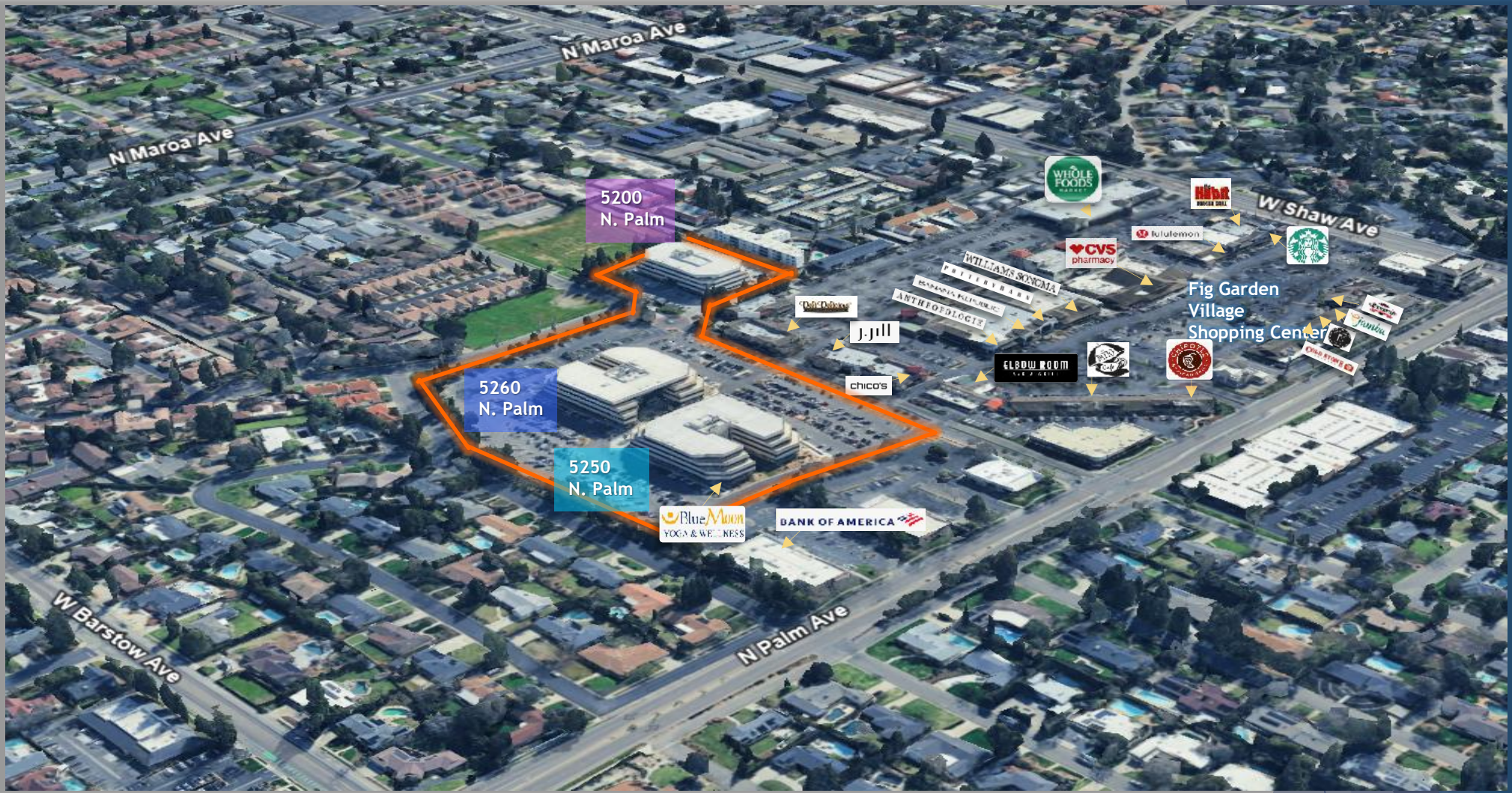
Fig Garden Financial Center